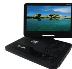
GVA Portable DVD Player 7" Screen 9,500 Points Code 0015