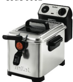
TEFAL 4L Deep Fryer 3200 watts 11,000 Points Code 0017