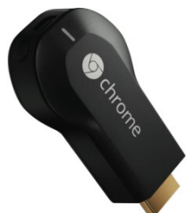
GOOGLE Chromecast Media Streaming 6,000 Points Code 0001