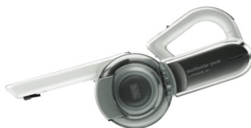
Black & Decker 18V Dustbuster Handheld Vacuum 15,000 Points Code 0005