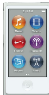
Apple iPod 16GB Silver 25,000 Points Code 0018