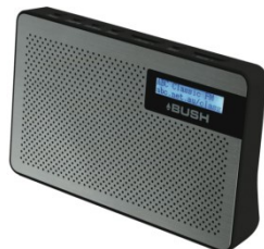
BUSH Digital Radio LCD Display 7,700 Points Code 0016