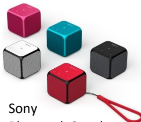
Sony Bluetooth Speaker 1 of 5 colours 11,000 Points Code 0009