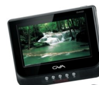
GVA 7" DVD Player Twin Screen In-Car Light & Compact 15,000 Points Code 0013