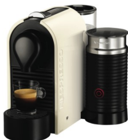
Nespresso Breville U Milk Capsule Machine with Milk Frother 26,000 Points Code 0006