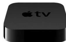
Apple TV Online Media Player 11,000 Points Code 0010