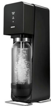
Sodastream Drink Maker 3 drink settings 10,500 Points Code 0008