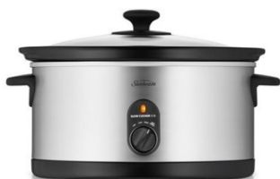
Sunbeam Slow Cooker 5.5L Capacity Stainless Steel 6,500 Points Code 0011