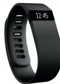
FitBit Charge Black Only Large or Small 17,000 Points Code 0014