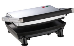
Sunbeam Café 200 watt Grill 2 Slice Capacity 4,500 Points Code 0003