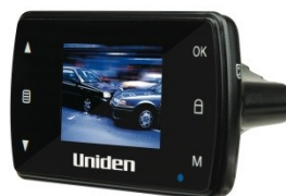
Uniden In-Car Dash Camera HD Quality Auto Record Sensors 7,500 Points Code 0012