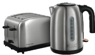
Russell Hobbs York Breakfast Pack 4-Slice Toaster Stainless Steel Kettle 11,000 Points Code 0002

We would like to offer all our members a Reward for their Rewards points! Order any of the following items below and pay for them using your RSL Rewards Points. T&C's apply.