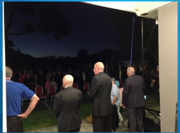
Members, their families, friends and guests all gathered outside the RSL; stand silently as the Last Post is played on ANZAC Day 2016.

On the 19 th of July, 2016, at Fromelles (Pheasant Wood) Military Ceremony the Highett RSL was represented by several of our members & their families who lost relatives in those horrific 24-hours.