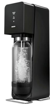
SODASTREAM 3 levels of effervescence Black only 12,000 points Code 0008