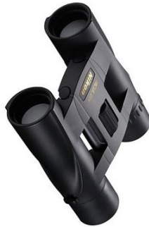
NIKON ACULON BINOCULARS Compact & light weight, Multi-coated lenses 12,000 points Code 0007