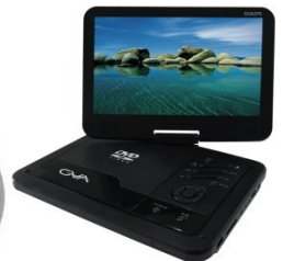
GVA Portable DVD Player 7" Screen 9,500 Points Code 0013