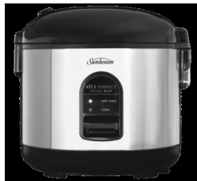
SUNBEAM RICE COOKER 7 cup capacity, stainless steel, easy to clean and use. 7,000 points Code 0010