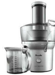
BREVILLE Juice Fountain 900 watts 0.8 Litre Capacity 10,000 points Code 0003