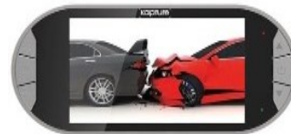
KAPTURE DASH HD CAMERA 9,000 Points Code 0012