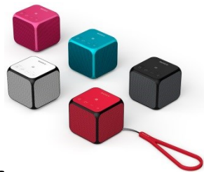
SONY CUBE SPEAKERS Bluetooth connectivity, pair with multiple speakers, compact and durable Available in 5 colours 10,000 points Code 0009