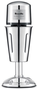
BREVILLE Milk Shake Maker easy to use, 600ml capacity 6,500 points Code 0004