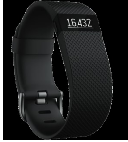
FITBIT CHARGE HR BLACK ONLY LARGE or SMALL 20,000 points Code 0001

We would like to offer all our members a Reward for their Rewards points! Order any of the following items below and pay for them using your RSL Rewards Points. T&C's apply.