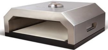
BBQ PIZZA OVEN Works on any BBQ, ready to go in 5 minutes, 5 star rating 15,000 points Code 0006