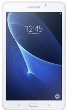
SAMSUNG GALAXY TAB 7" WiFi, 8GB, white only, long battery life, Kid safe modes 20,000 points Code 0006