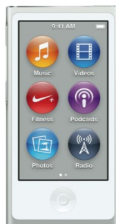
APPLE IPOD 16GB Silver Bluetooth, FM Radio 25,000 Points Code 0011