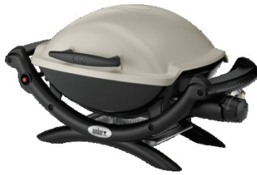
WEBER BABY Q BBQ Compact/easy to use 30,000 points Code 0002