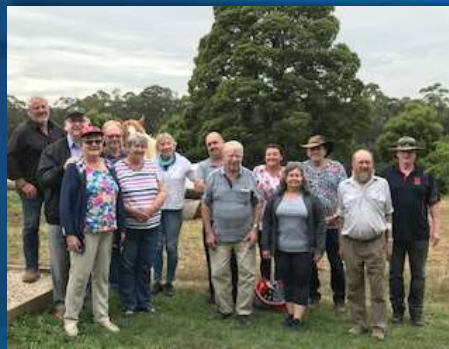
Veterans and their Family at the Path of The Horse

Donation to the Brothers in Arms Memorial. Highett RSL donated to the Brothers in Arms Memorial Project and some members of Highett RSL attended the pouring of the brass monument that was subsequently shipped to Belgium and placed within the memorial site near Polygon Wood. Please visit the web site for more details: www.brothersinarmsmemorial.org